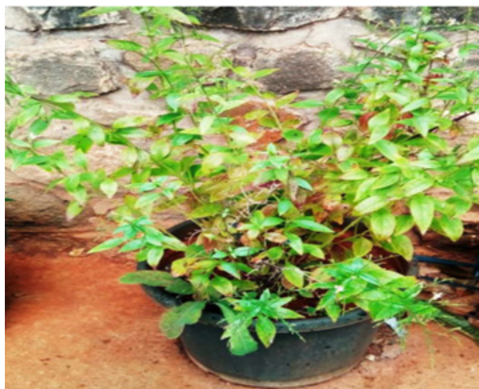
Figure 1: Andrographis paniculata (Acanthaceae).

In order to evaluation of possible crystallization, the oxymel was placed in refrigerator for a period of a week and then examined for precipitation.